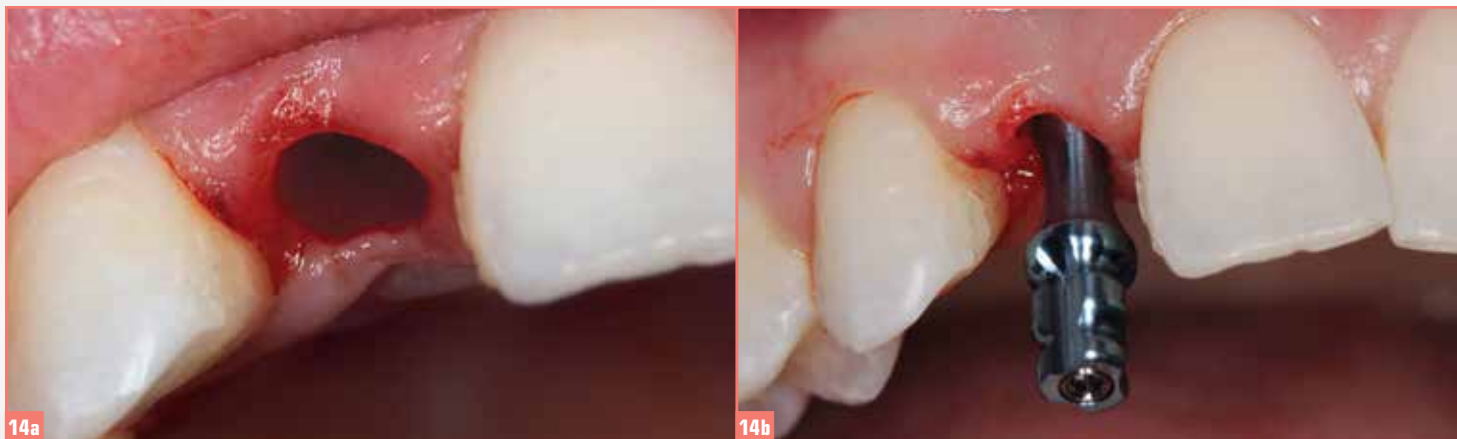
Figures 14a, 14b: After removing the cover screw, a transfer coping was attached to the implant.

The cover screw was removed, and an impression coping was hand-tightened into the conical internal hex connection of the Hahn Tapered Implant (Figs. 14a, 14b). Panasil® vinyl polysiloxane material (Kettenbach; Huntington Beach, Calif.) was used to create a final impression (Fig. 15).