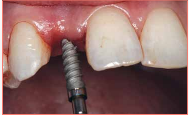
Figure 8: The implant was threaded into the undersized osteotomy.