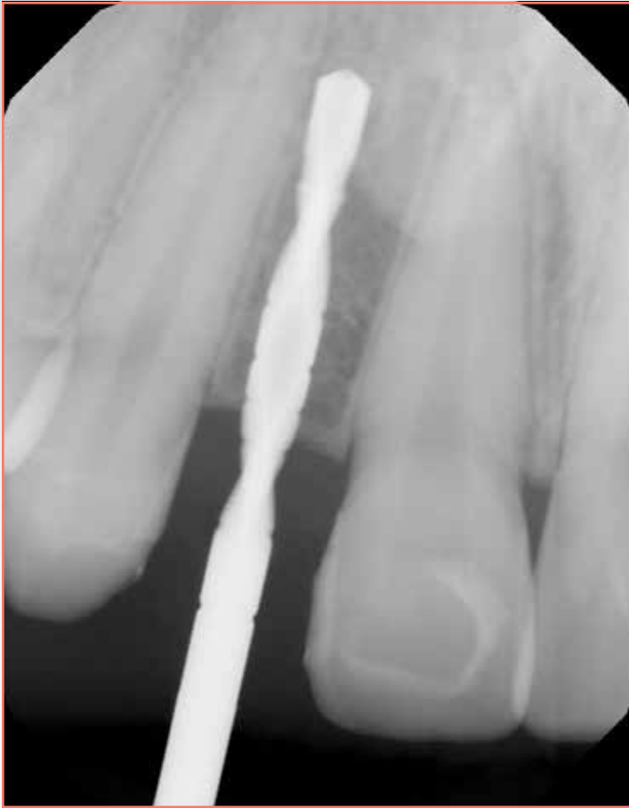
Figure 7: The depth of the osteotomy was about 13 mm.