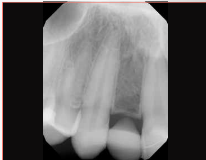
Figure 3: Though there was limited space at the maxillary right lateral incisor site, radiography indicated that there was sufficient bone volume for the placement of an implant.

A pilot drill was centered between the teeth adjacent to the edentulous site. The osteotomy was positioned approximately 3 mm palatal to the facial aspect of the adjacent