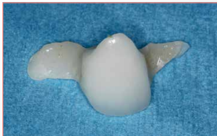
Figure 5: The acid-etch bridge was removed without complication.