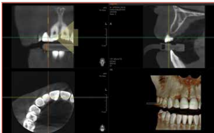
Figure 4: With CBCT technology, the quantity and quality of bone can be assessed digitally.