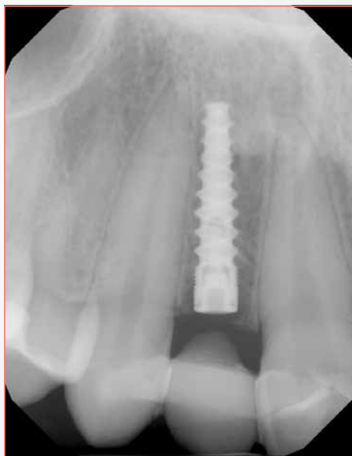
Figure 12: Full osseointegration was achieved four months after implant placement.