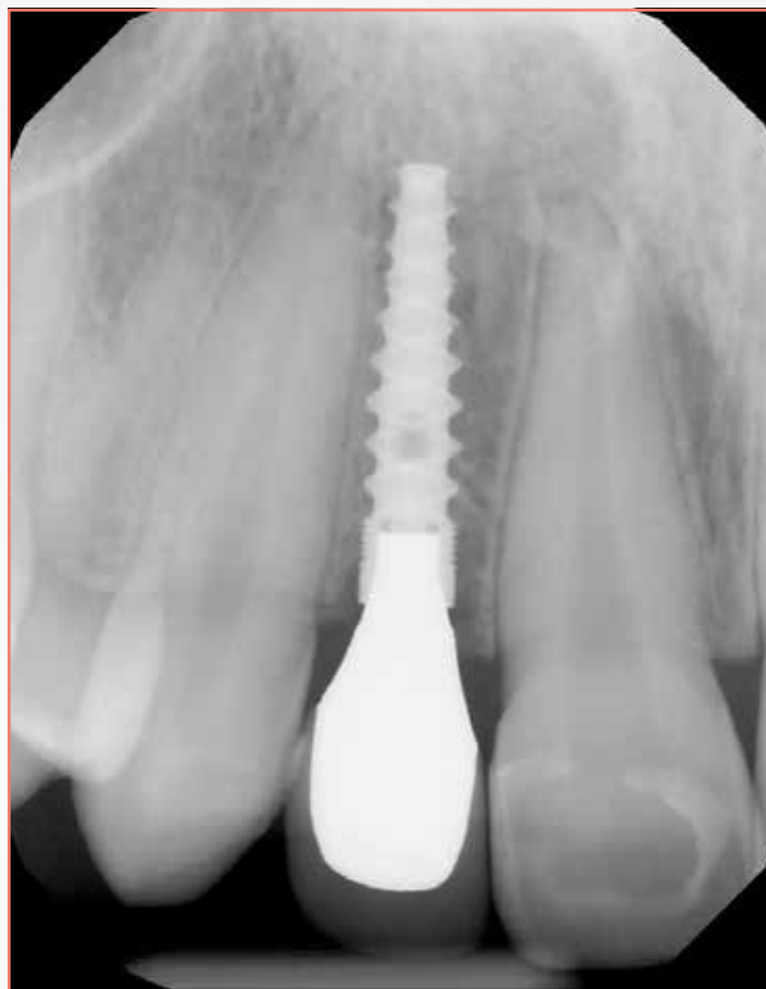
Figure 18: Radiography demonstrated complete seating of the final restoration and preservation of crestal bone at the implant site.