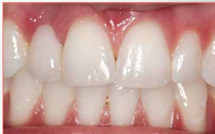
Figure 11: The acid-etch bridge that the patient had been using prior to implant treatment served as a temporary during the healing period.

The diameter size and tapered body of the implant was ideal for the limited space that was available.