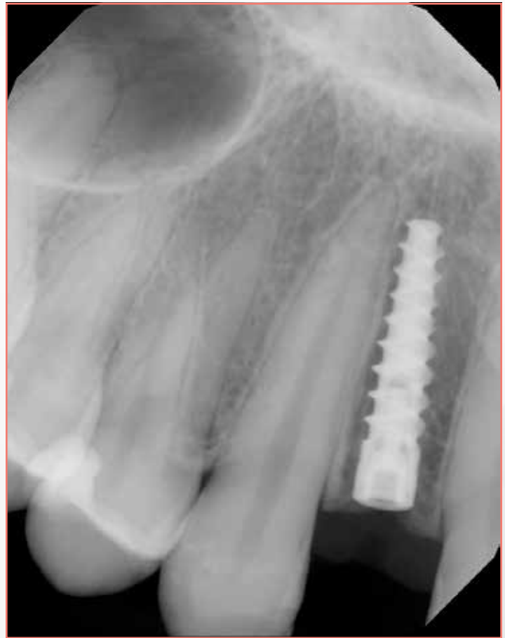
Figure 10: Despite the small space that was available, a 3.0-mm-diameter tapered implant was placed with ease.