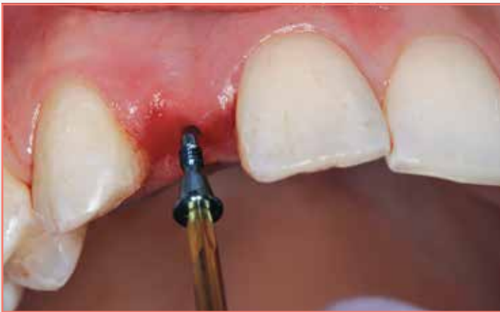
Figure 9: A cover screw was hand-tightened into the implant.