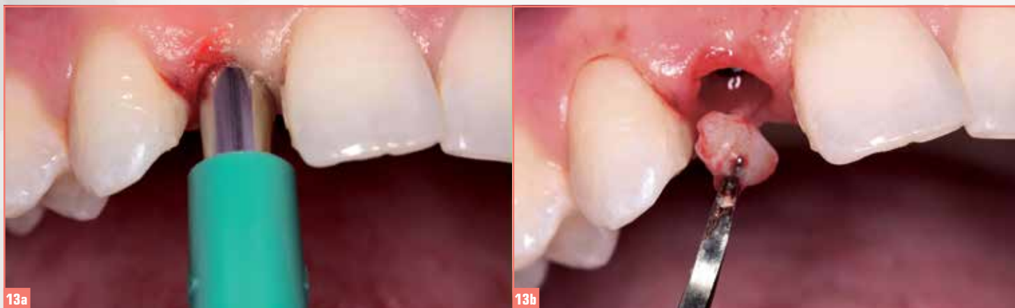
Figures 13a, 13b: The implant was exposed with a tissue punch.