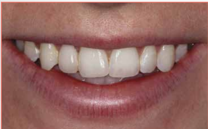
Figure 2: Though the acid-etch bridge provided good esthetics, it would come loose, causing the patient to worry about its long-term function.

her general dentist. The Hahn™ Tapered Implant System (Glidewell Direct; Irvine, Calif.) was utilized to restore the missing tooth. The implant system includes implants with narrower diameters, a feature that is beneficial for cases in which space is limited. Additionally, the tapered body of the implant is ideal for use in anatomically constricted areas. The prominent thread design also allows the implant to be more easily positioned and controlled by the clinician during placement. Following integration of the implant, a cement-retained BruxZir® Anterior crown provided a strong, esthetic final result.