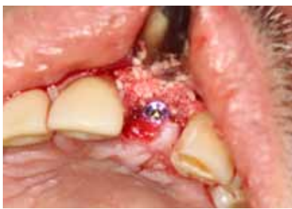
Figure 18: The allograft material is not crushed into position, rather firmly packed. The facial defect has been filled in with the allograft material.