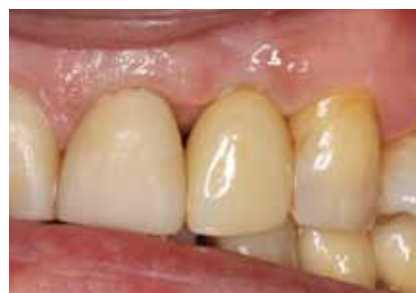
Figure 29: Need Caption