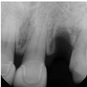
Figure 8: Curetting of the socket reveals a significant facial defect as a result of the periodontal deterioration. This defect must be corrected to maximize final esthetics and emergence profile of the final implant retained crown.