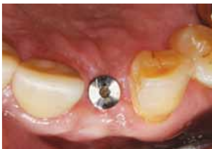
Figure 25: A zirconia Bruxzir custom abutment is fabricated by Glidewell Lab. Note the margins of the preparation are at the gingival level. Blanching of the tissue is normal as the abutment contours are wider than the healing abutment.