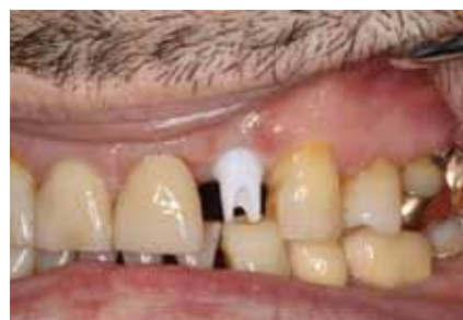
Figure 27: The final implant retained Bruxzir anterior esthetic crown immediately after seating.