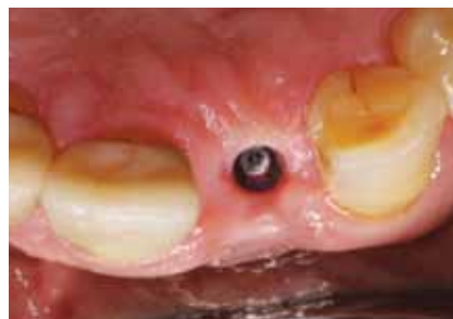
Figure 26: Occlusal view of the margins of the custom abutment.