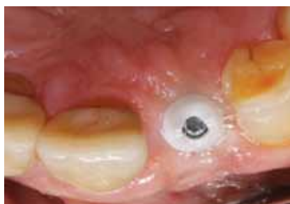
Figure 28: One week follow up illustrates how the interdenal papilla was reformed due to physiologic positioning of the implant and maintenance of bone contours.