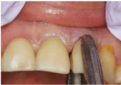
Figure 5: A tooth delivery instrument is used to elevate the tooth out of the socket maintaining the soft tissue contours.