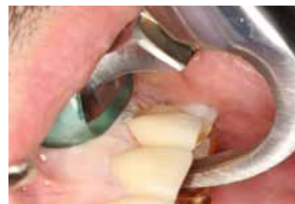
Figure 4: An atraumatic extraction is performed using the Golden Dental Solutions Maxillary anterior Physics forcep. This forcep creates tension on the palatal aspect of the root and the rotation of the instrument lifts the tooth up and out of the socket site.