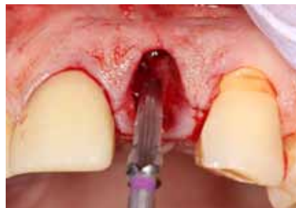
Figure 12: Once proper angulation and depth are determined using the Pilot drill, the osteotomy is widened using the tapered osteotomy bur. Each bur is measured to a precise length, making crestal positioning easy to demonstrate.