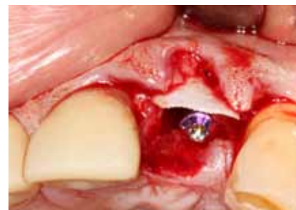
Figure 16: I placed the membrane facially prior to any graft material being added. The membrane is secure without any force applied.