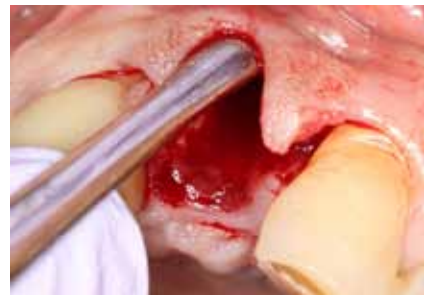
Figure 10: A periosteal elevator is used to elevate the tissue past the facial defect. The palatal tissue is also reflected.