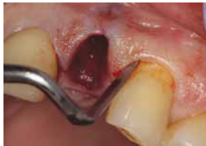
Figure 9: An Orban knife is used to precisely incise the interdental papilla area so exposure of the facial defect will become apparent.