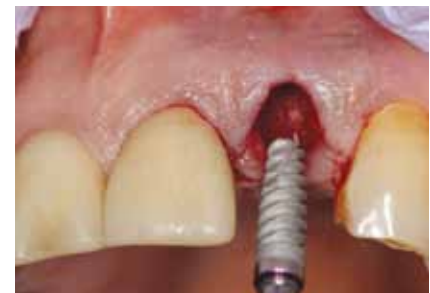
Figure 13: Here a 3.5mm X 11.5mm Hahn dental implant will be torqued into the prepared osteotomy site. Note the aggressive threads of the implant which provide ideal initial stability in the compromised osteotomy socket.