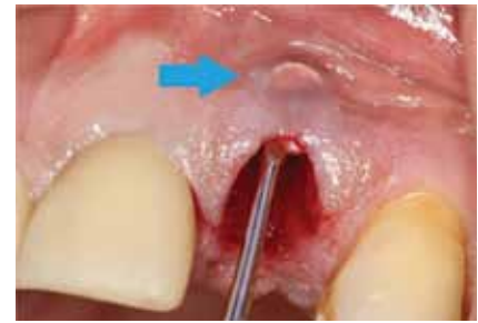
Figure 7: Periapical radiograph of the extraction site.