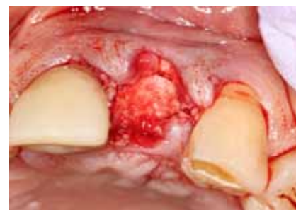
Figure 19: The membrane is then tucked over the site onto the palatal surface, tucked at least 2mm onto palatal bone. The membrane is passively positioned and will remain in place during the healing period.