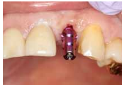
Figure 23: After integration a 3mm tall healing abutment is torqued to place, note the healthy tissue and facial wall intact.