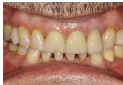
Figure 1: Our patient presented with a periodontally failing maxillary left lateral incisor which will require extraction.

The instrument is not intended to remove the tooth in total, rather to luxate it up to 3mm. A tooth delivery instrument illustrated in figures 5 and 6 lifts the tooth out of the socket. A radiograph is made to insure that the entire tooth root was removed (figure 7) Upon curetting of the socket it is