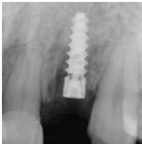
Figure 21: Post operative periapical radiograph demonstrates the ideal position of the implant and the grafted material filling in the defect area. The implant is positioned approximately 3mm apical to the cement-enamel junction of the adjacent teeth. This again will allow for proper physiologic healing, maintenance of the interseptal bone and interdental papilla. This will allow for emergence profile and proper esthetics.