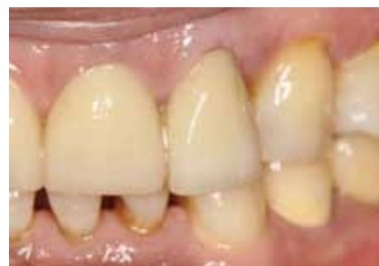
Figure 3: Tissue changes are apparent on the facial aspect.