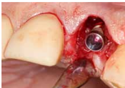
Figure 14: The implant is positioned approximately 1mm sub crestal which allows for physiologic healing around the implant. Note, however, the facial wall is missing and will be augmented with allograft material and a membrane.