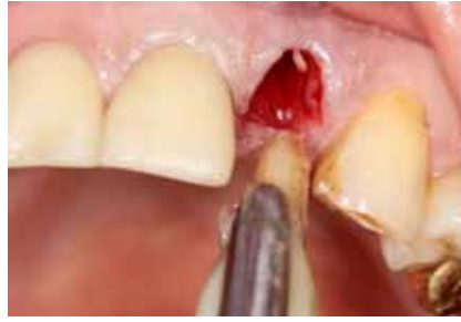
Figure 6: The extraction is clean and precise without trauma to the soft tissue or adjacent teeth.