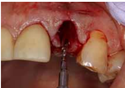
Figure 11: The Hahn dental implant system from Glidewell Lab uses a Pilot drill to make the initial osteotomy site. Note the positioning of the drill. We center mesial and distally between the adjacent teeth and position the initial penetration approximately 3mm palatal to the facial contours of the adjacent teeth. We do not go directly into the socket site, rather are palatally positioned using the palatal wall of the socket as a guide. Radiographs are made to insure proper angulation and depth for the implant.