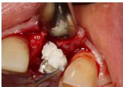
Figure 17: Cortico-cancellous demineralized allograft material (Gold-Oss from Golden Dental Solutions), is wetted with sterile saline creating a gel. This material is then firmly packed against the membrane and into the facial defect.