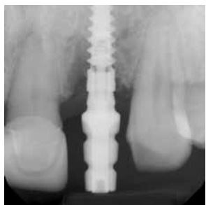
Figure 24: The healing abutment provides for a healthy tissue cuff formation