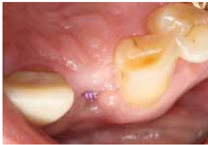
Figure 22: An impression coping is placed into the implant after approximately 4 months of integration of the implant.