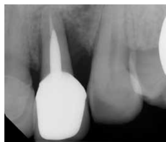
Figure 2: The Periapical radiograph illustrates bone loss on the distal aspect most likely the result of a horizontal root fracture at the level of the post.