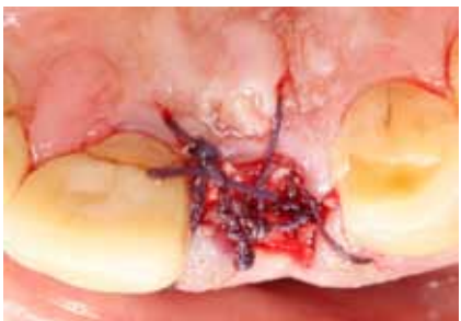
Figure 20: Vicryl sutures are placed over the surgical site to hold the tissue in place.