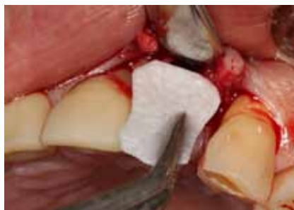
Figure 15: A resorbable membrane (Epiguide) from Curasan Corp is cut to the proper size. Note that the membrane must extend a minimum of 2mm apical to the facial defect and at least 2mm on stable palatal bone. This will insure that the membrane remains in place during the integration period.